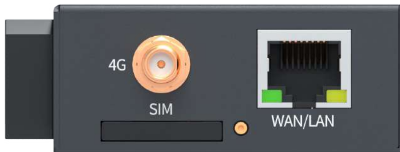
EG8200Lite Top View