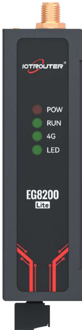
EG8200Lite Front View