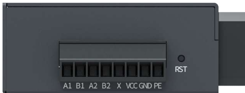
EG8200Lite Bottom View