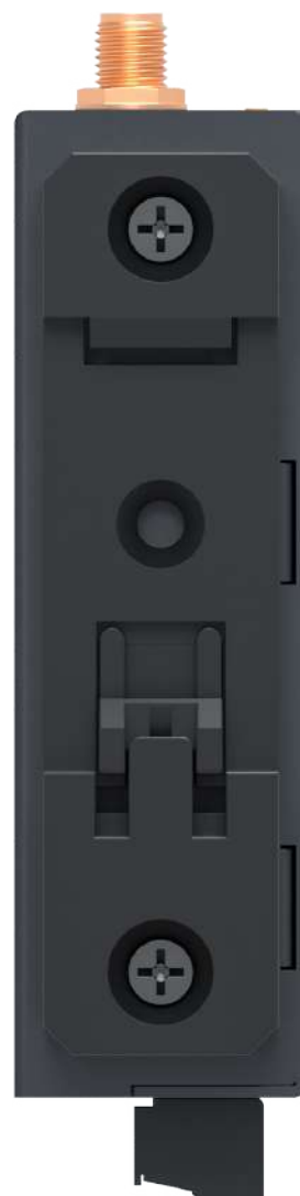
EG8200Lite Rear View